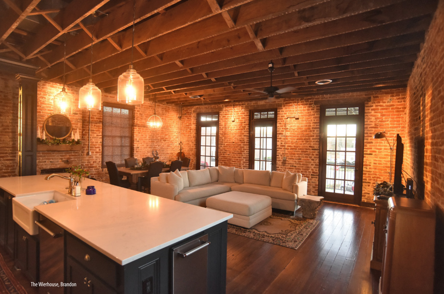
The Wierhouse, Brandon