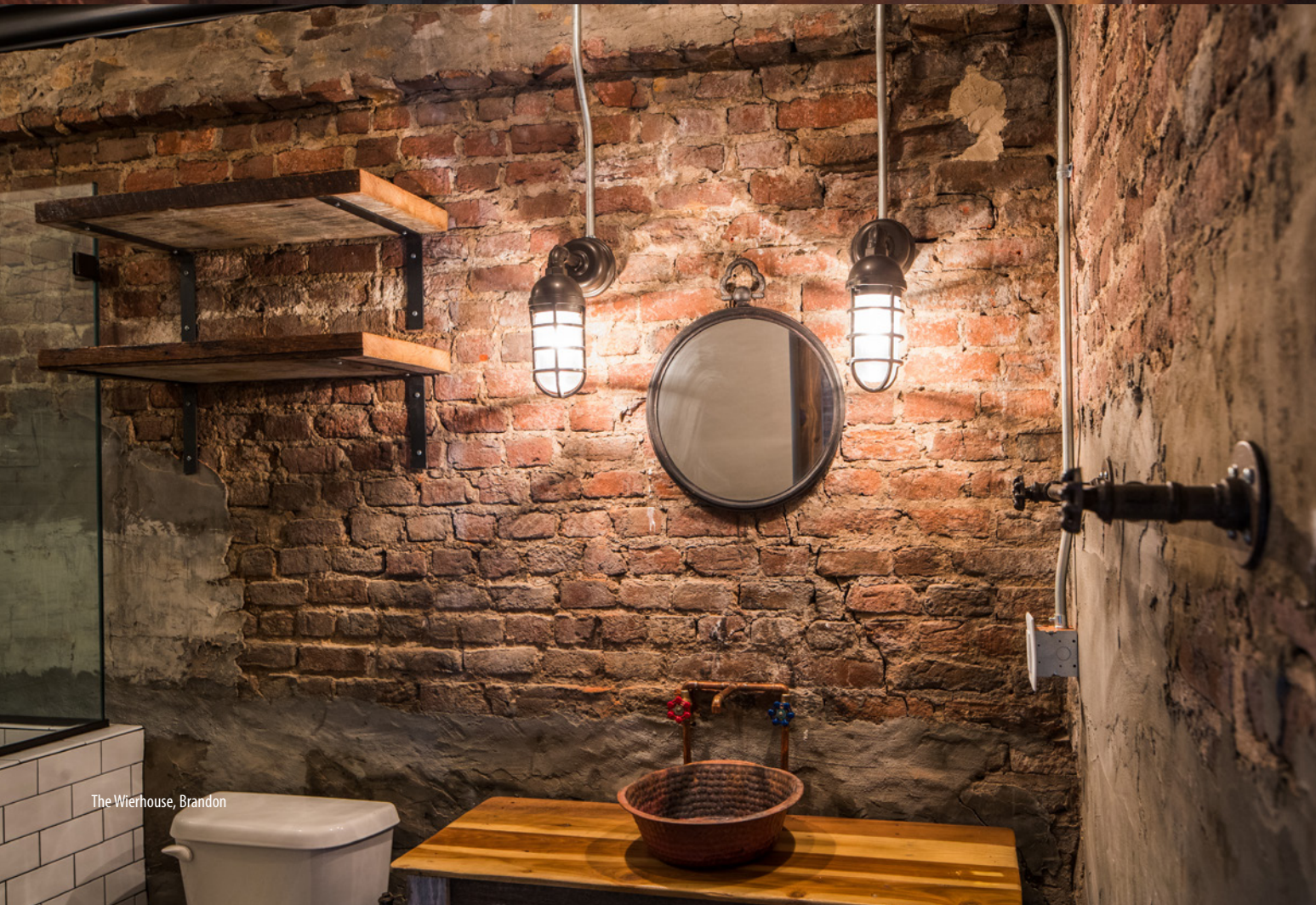
The Wierhouse, Brandon